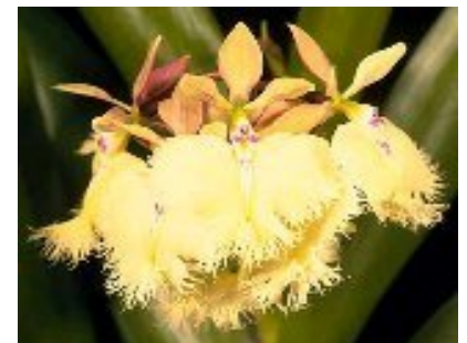
Epi Annelie Wans 'Lisa Marie'