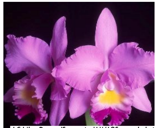
LC Lilac Dream 'Symmetry' AM/AOS awarded at our show