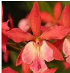
Kirchara Tropical Jewel