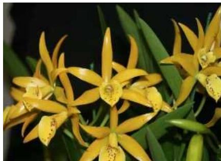
Blc Roman Holiday 'Beverly's Bliss' AM/AOS