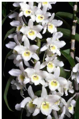
Den Crystal Pink 'Rhon-Ron' HCC/AOS awarded at our show