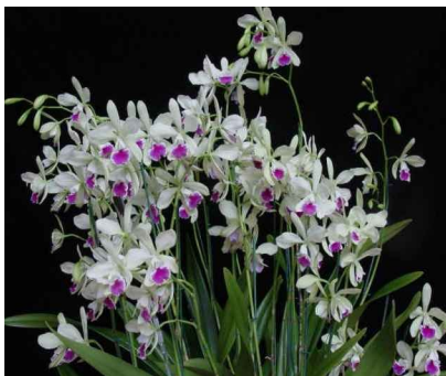
Catyclia El Hatillo 'Pinta' CCM/AOS