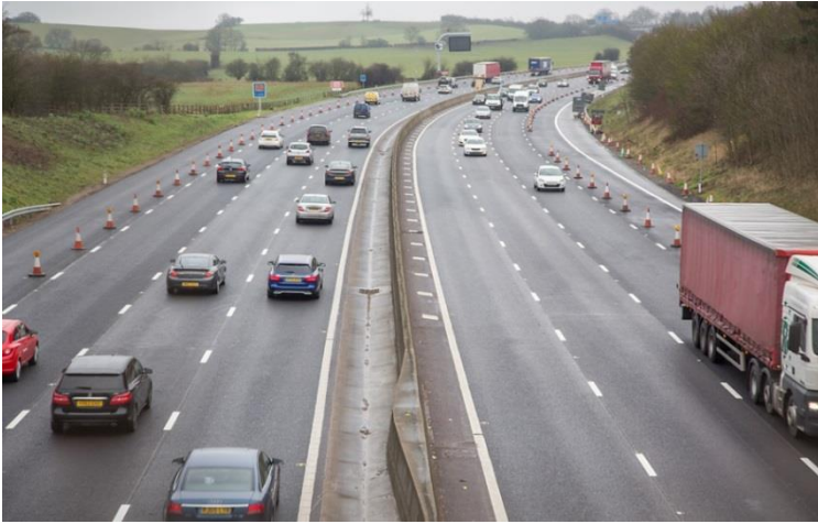
Final white lining on the M5 between junctions 4a and 5

appreciate your patience and understanding as we have completed a range of operations, especially during necessary night time closures.