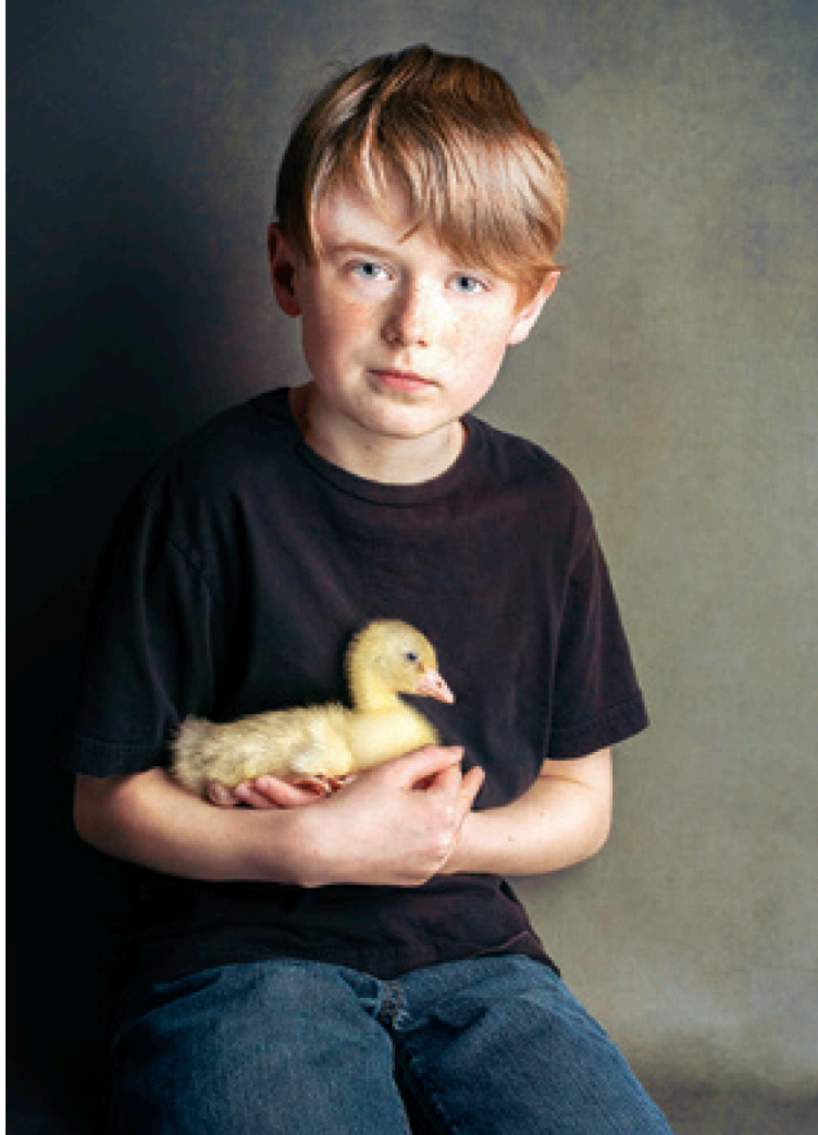
A Boy and His Gosling