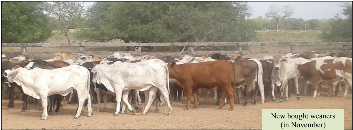
New bought weaners (in November)