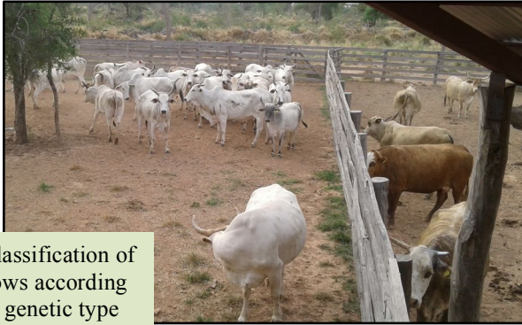
Classification of cows according to genetic type