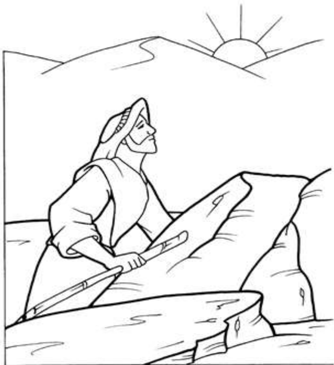
The Temptation of Jesus