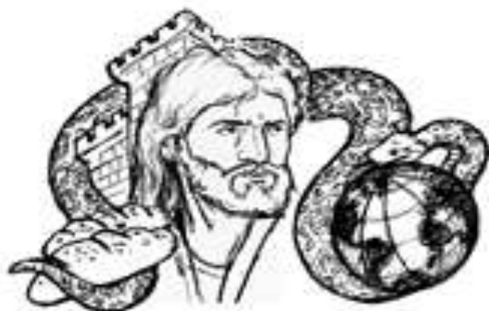
The Temptation of Jesus