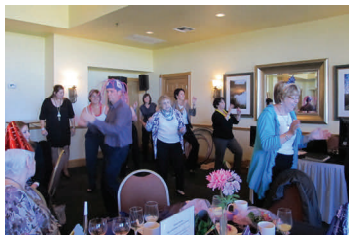
The Electric Slide—check out our talented dancers!