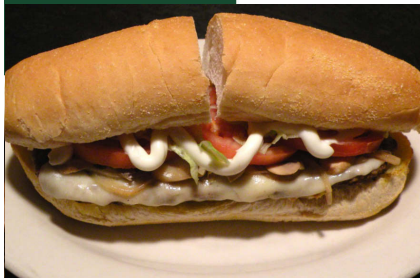
Steak "Ruthies Way"