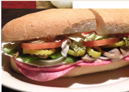
Sub "All the Way"