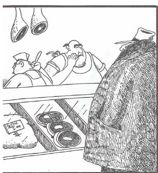
Well, I never thought about it before . . . but I suppose I'd let the kid go for about $1.99 a