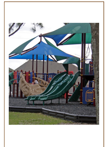
Morgan Park Play structure

Call Before You Dig: Dial 8-1-1 http://www.austinenergy.com/customerCare/OtherServices/callbeforeyoudig.htm