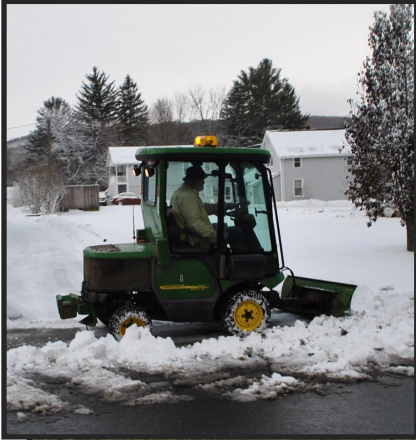
THE MAN OF THE HOUR...