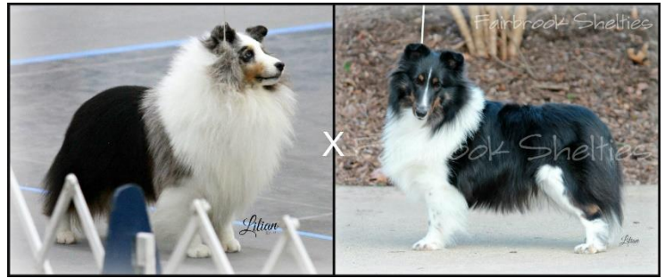
"Shakem" and "Joy"