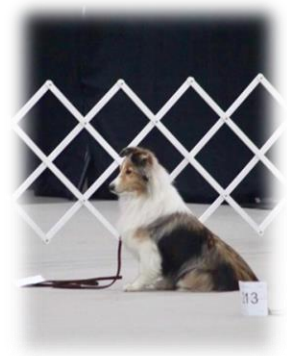
Mollie in a Long Sit in Obedience at the 2017 ASSA National, Purina Farms, MO

VTCH UACHX UACH ARCH ARCHX TALIESIN GOOD GOLLY MISS MOLLIE CGC BN CD RN RA RE RAE HT PT HIAd HSAdM NA NJP NAJ NFP OAP OJP AJP AXP RATI RATN RATO TT URO-1 URO-2 AG-1 AG-2 RL-1 RL-2 RL-3 RLV RL1X RL2X RL3X CW-Ob2 CW-SR CW-AR CW-ZR1 CW-ZR2