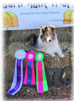
Mollie earned her Barn Hunt Open Title in February 2018 and was High Scoring Dog