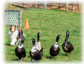
Mollie driving the ducks towards the penning area Herding Trials, April 21, 2018 Keepstone Farm, Berryville, VA