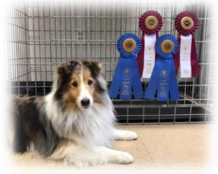
Mollie earned her Excellent JWW and Open FAST at the SSCGB 2017 Agility Specialty, Halethorpe, MD