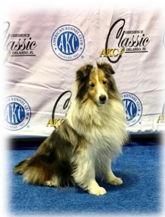
Mollie received an invitation to compete in the AKC 2017 National Obedience Classic