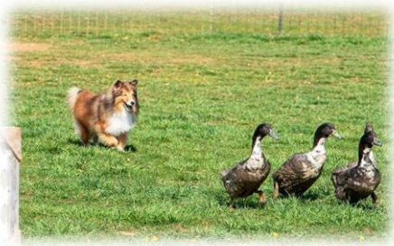
Savannah driving the ducks, ASSA National Herding Trials, April 21, 2018 Keepstone Farm, Berryville, VA

Dixie Doodle earned double QQs in her two agility runs, adding towards her MACH2 title.