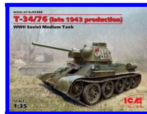
ICM Kit #35366 in 1/35 th scale (with Cupola)