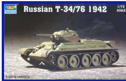
Trumpeter Kit #07206 in 1/72 nd scale