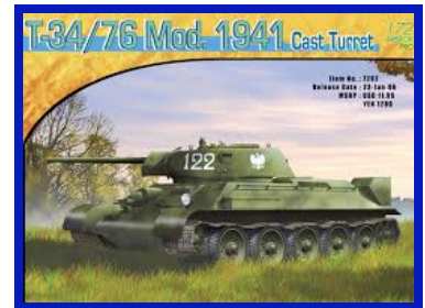
Dragon Kit #7262 in 1/72 nd scale