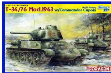
Dragon kit #6564 in 1/35 th scale