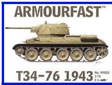
Armourfast Kit #99022 in 1/72 nd scale