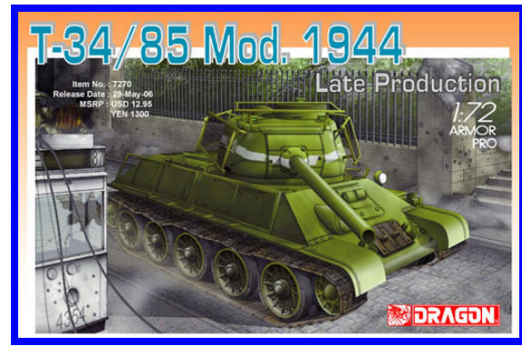
Dragon Kit #7270 in 1/72 nd scale

Hopefully that is enough of an introduction to get you interested in a Group T-34 build. If you have any questions about T-34's, post them on the AMPS Central South Carolina Wildcats Facebook page or ask at a meeting. I'm looking forward to seeing some cool models!