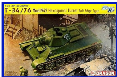
Dragon kit #6242 in 1/35 th scale