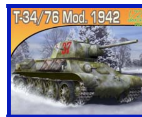
Dragon Kit #7266 in 1/72 nd scale