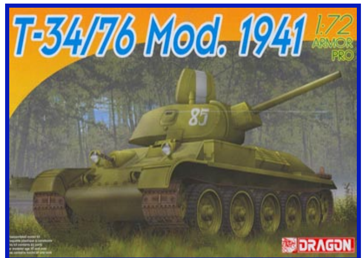
Dragon Kit #7259 in 1/72 nd scale