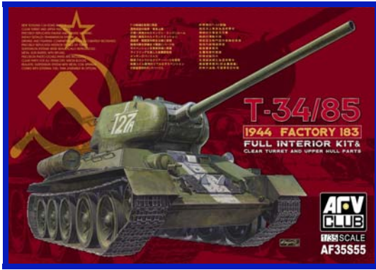
AFV Club Kit # AF35S55 in 1/35 th scale (Full Interior)