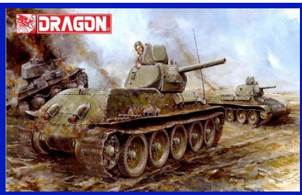
Dragon Kit #6418 in 1/35 th scale