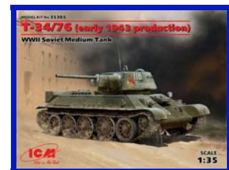
ICM Kit #35365 in 1/35 th scale