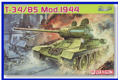
Dragon Kit #6319 in 1/35 th scale