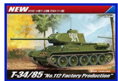
Academy Kit #13290 in 1/35 th scale [This is a brand new kit appropriate for late and post war T-34 85's]