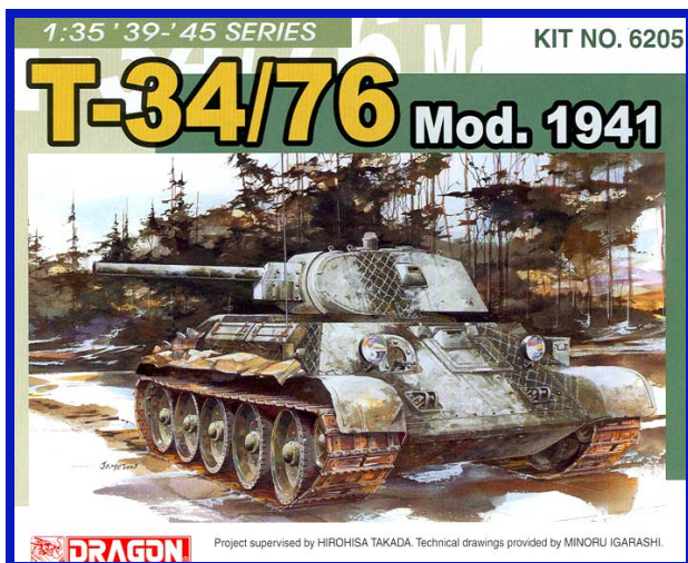
Dragon Kit #6205 in 1/35 th scale