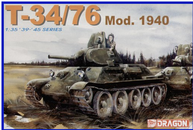
Dragon Kit #6092 in 1/35 th scale