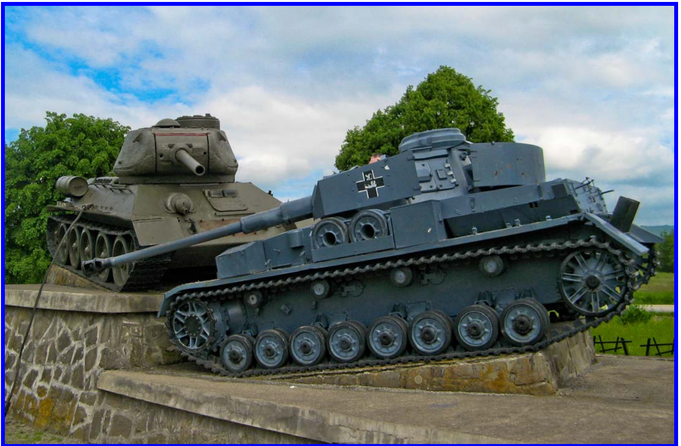
“Battle of the Dukla Pass of 1944” Memorial, on the Slovak side of the Dukla Pass

Russia’s T-34 Tank hardly requires introduction. So if you’d rather not read one, skip ahead to the asterisks line below!