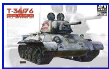
AFV Club Kit #35144 in 1/35 th scale (Full Interior)