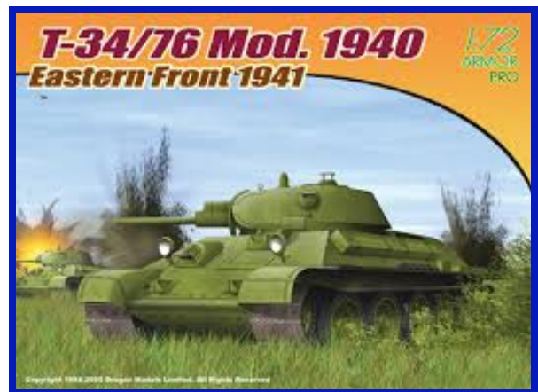
Dragon Kit #7258 in 1/72 nd scale