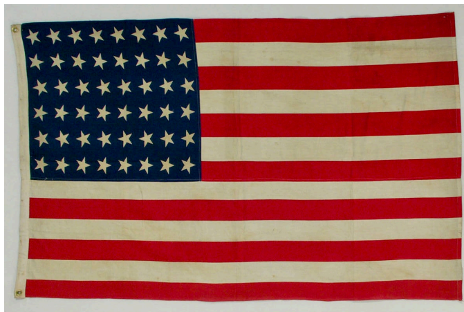
Model A period correct flag with 48 stars