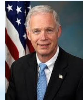
Sen. Ron Johnson DC Office: (202) 224-5323