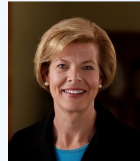
Sen. Tammy Baldwin DC Office: (202) 224-5653