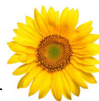
Fjellheim Event Calendar for August/Sept/Pct 2021