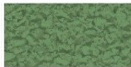
Standard Green RH10