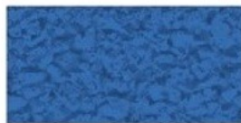
Standard Blue RH20