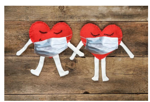
HAPPY VALENTINES DAY!!! 2021 STYLE