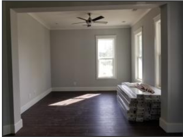
Den or Formal Dining Room