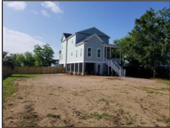
View from the back corner of property