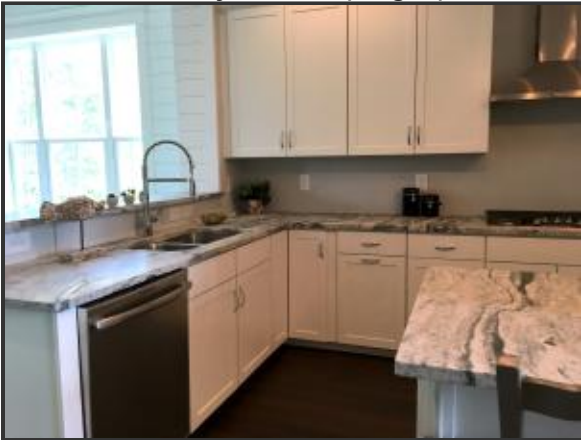
Battery Kitchen (staged)