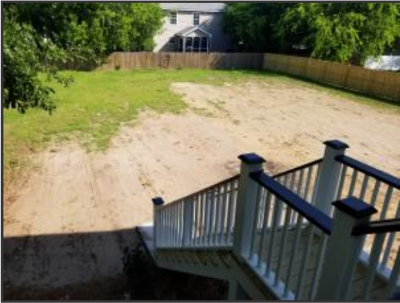
Spacious Fenced Yard