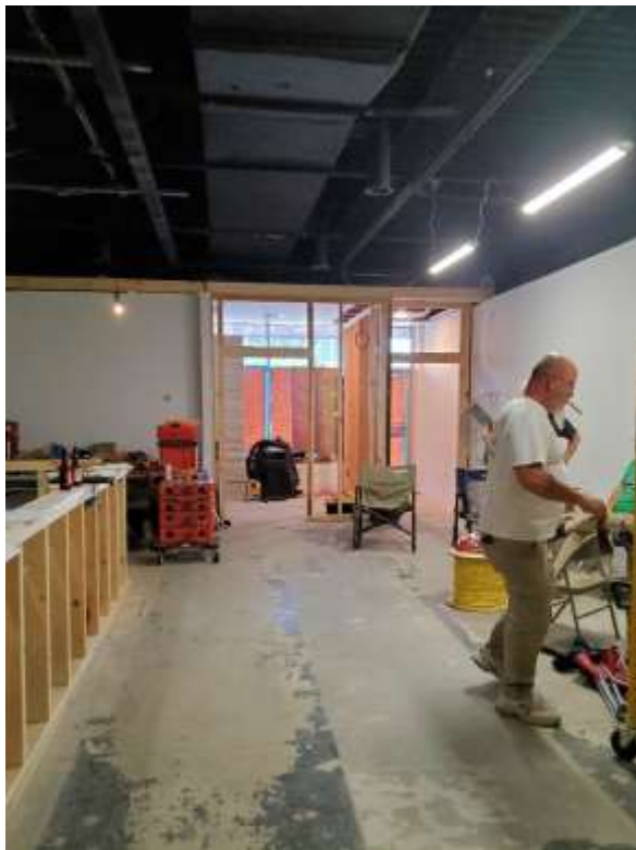
Looking from rear to front. Construction coordinator Anvil seems to be getting ready for a well-deserved break.