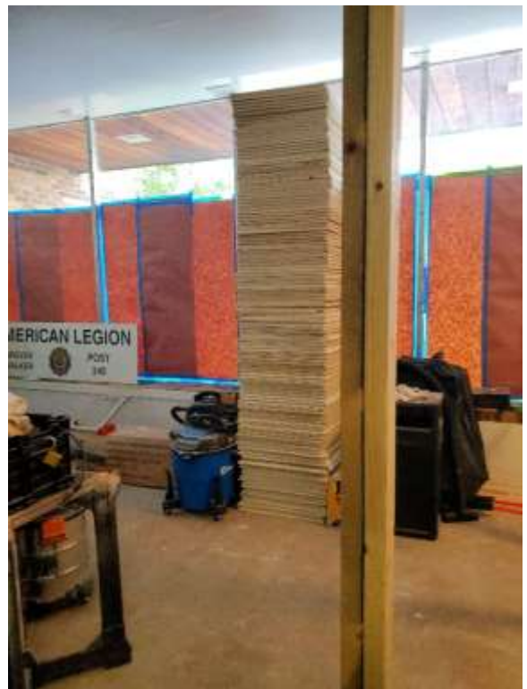
Looking into the front meeting area. The front door is to the right in a separate vestibule. Center of the photo is stacked ceiling tiles.