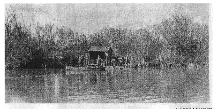
Time, use and habitat on the delta has changed over the decades.