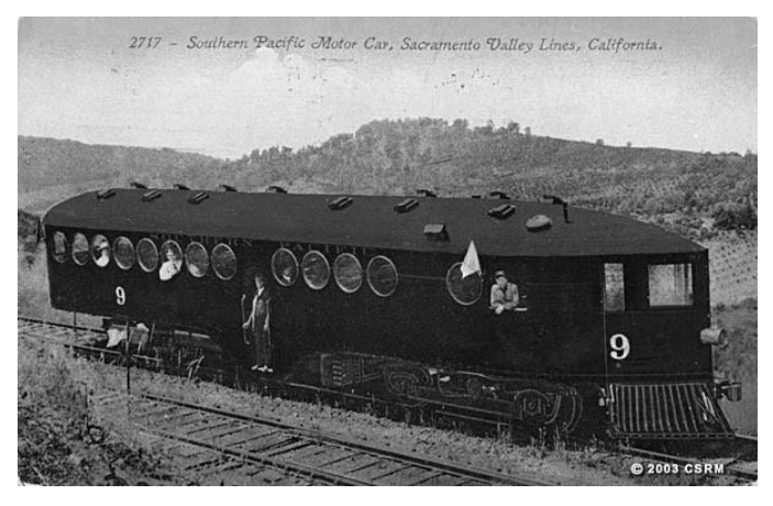
A McKeen car – one was used on the Walnut Grove Branch Line