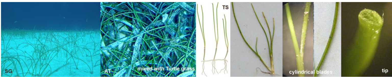
MANATEE GRASS Cymodocea filiformis (Syn. Syringodium filiformis )