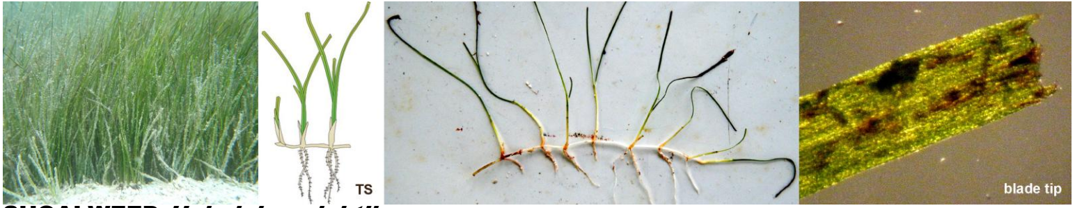
SHOALWEED Halodule wrightii