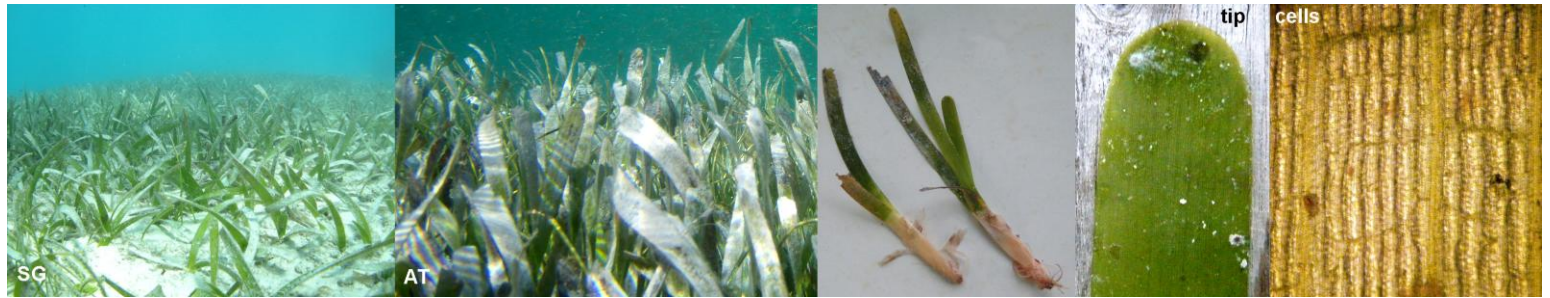
TURTLE GRASS Thalassia testudinum

ENGELMANN'S SEAGRASS Halophila Americanae engelmannii