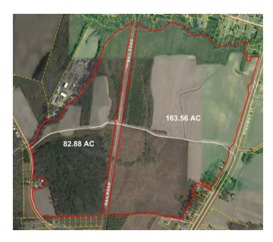
Beaufort County Industrial Park at Chocowinity