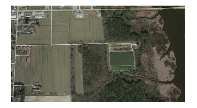
Aurora Industrial Park