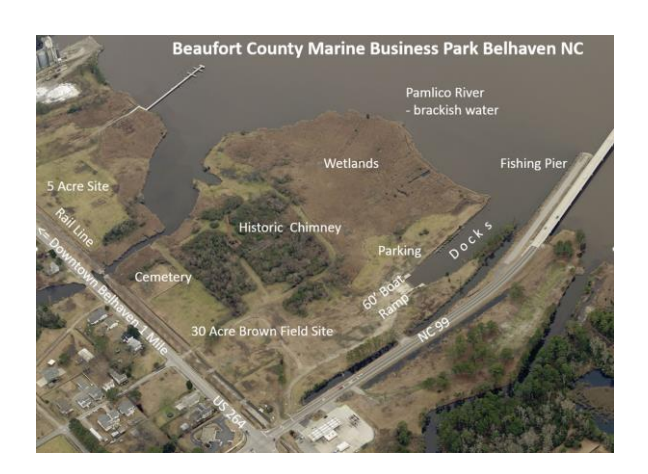
Beaufort County Marine Park at Belhaven