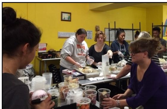
Ritenour HS students volunteering in the Food Pantry

If you would like to do something to make our community stronger, come and spend a little time in the food pantry! We need help stocking the store (T,W,F,S from 8:30am-noon), and processing pallets of food (M and F from 1-3pm).