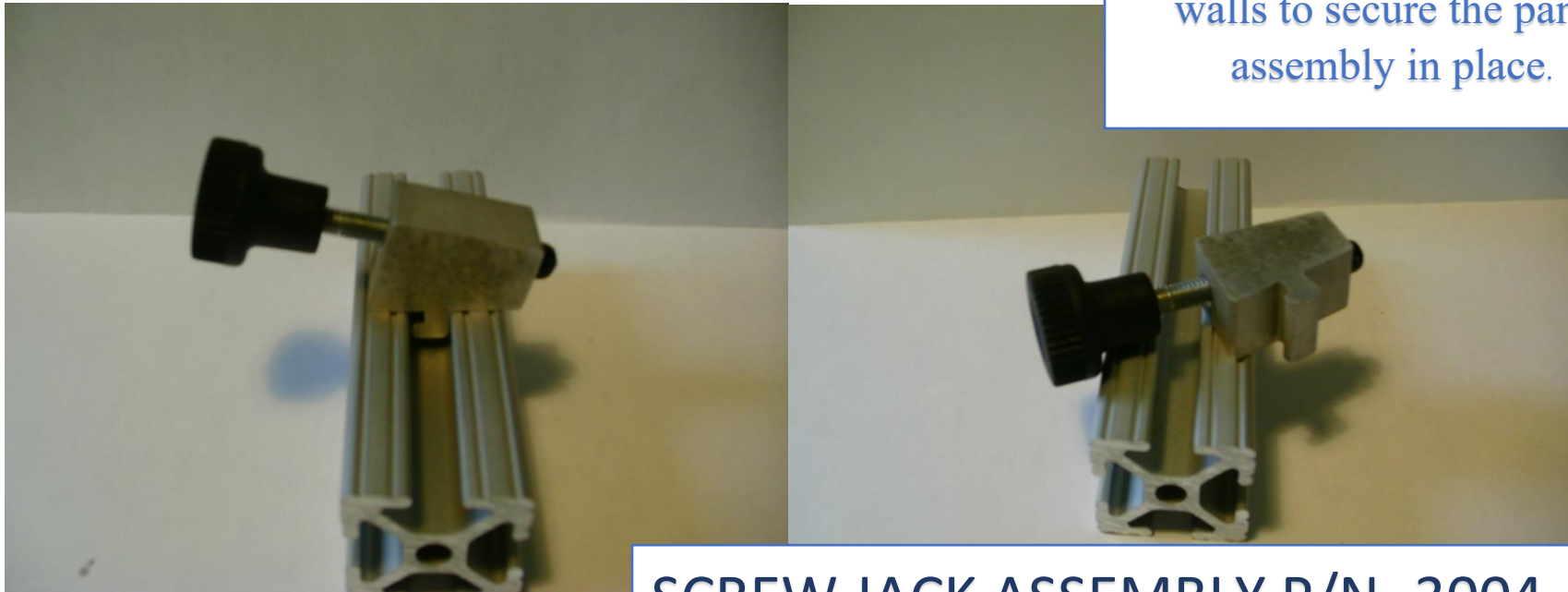
SCREW JACK ASSEMBLY P/N -3004

The screw jack assembly fits into the top panel rail or side rails and allows you to apply pressure to GWB ceilings or walls to secure the panel assembly in place.