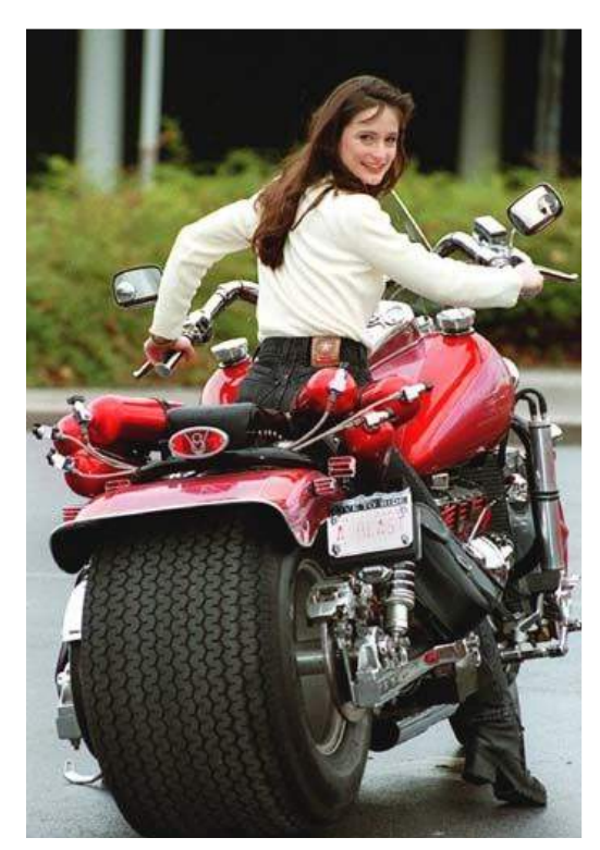
"Does this tire make my butt look big?"