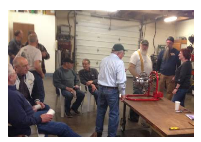
OTC members mingle with Modeling Club