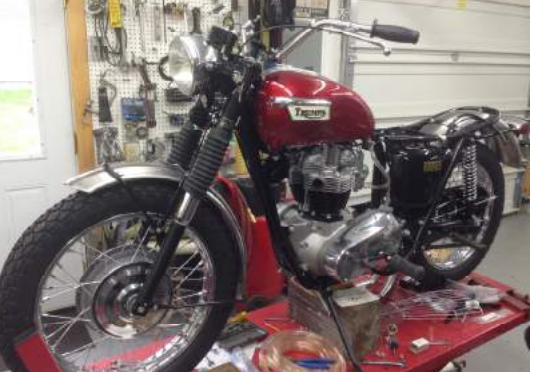
Tom Rs 1969 Triumph TR6C