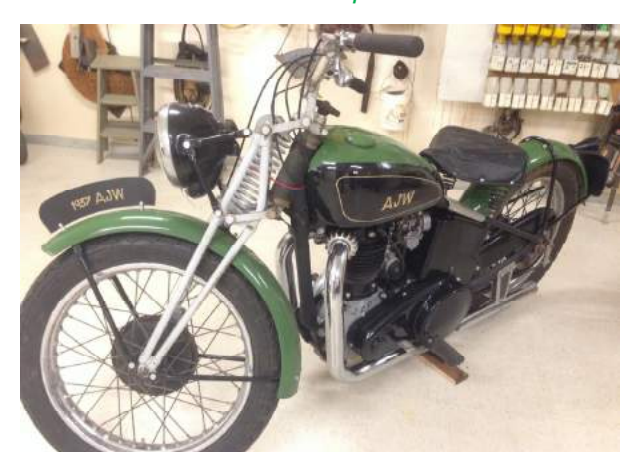
Terry's 1937 AJW