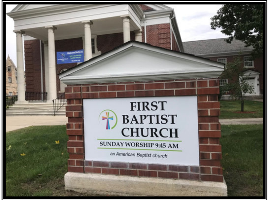
Our new road sign was installed recently!

As we seek to follow the way of Jesus, we welcome all people to fully participate in our fellowship: all ages, colors, backgrounds, political affiliations, and physical and mental abilities; male and female, gay and straight, rich and poor, single and married. We are all God's children, and all are welcome here.