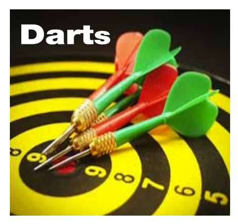
Every Thursday starting at 6:00 p.m.