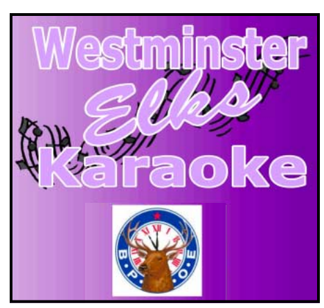
June 2nd & 16th 7:30 p.m. to 10:00 p.m.