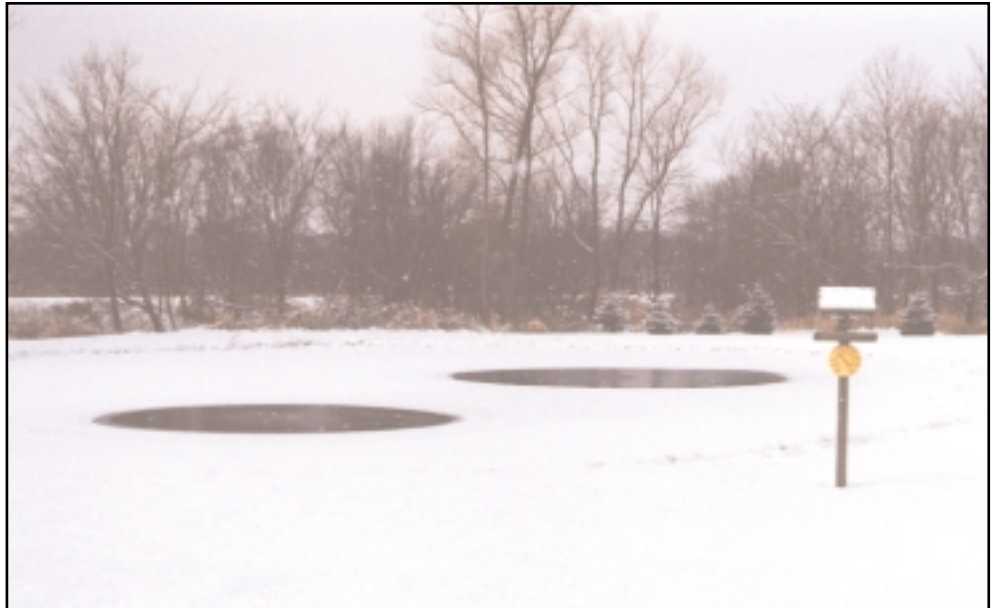
Two-pod Airtronics system operating in a two acre pond

The Airtronics diffused air system by Watertronics is ideal for seasonal sub-surface aeration as well as preventing winter ice freeze overs. The 115 volt, 3/4 HP vane-type compressor will service up to four pods and provide enhanced aerobic digestion in up to a two acre pond at 12' to 20' submergence. It is easy to install (average three hours), and built to last with quality components, stainless steel pod skirts and heavy duty air supply tubing which requires no weighting.