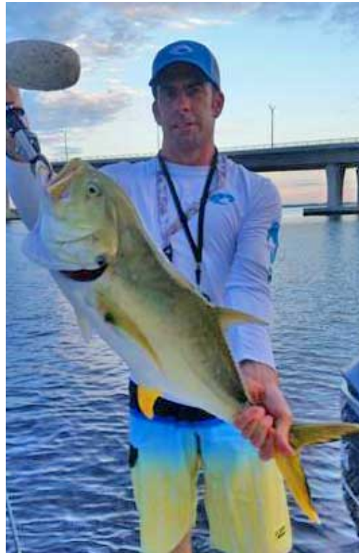
When you see those huge showers of baitfish, there is usually a heavy duty predator making them skitter. Here is a really big Jack, caught near one of our local bridges. This one looks likely to swallow more than one baitfish at a time.