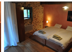
Family sized bedroom with 3 single beds and a crib.