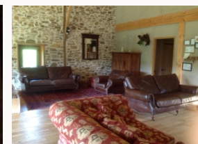
The meeting area with space to read, relax, nap and enjoy each other's company.