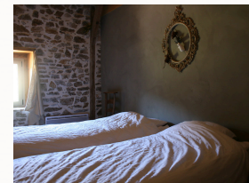
Bedrooms have windows that open to let the country air and cool breezes in.

This week we will do some sightseeing and some cooking, a well balanced week aimed at giving you just enough of each adventure to keep you happy but not foot weary! You'll see some stunningly beautiful historic towns and help to create amazingly memorable culinary dishes.