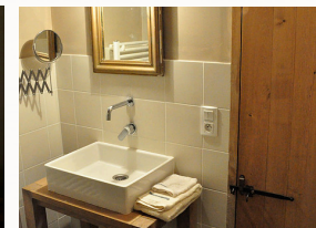
The bathroom sinks are stand alone with room for your toiletries etc.