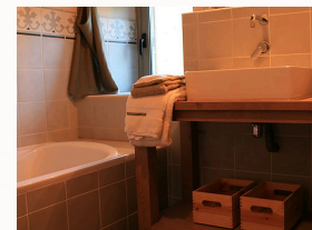
Bathroom with tub and shower combo.

This week will be "on the road" visiting an artisan villages, the historical town of Figeac, the caves of Pech Merle and many other adventures. Of course we will visit farmers markets too - we have to have market fresh goodies for dinner! There will be lots of walking!