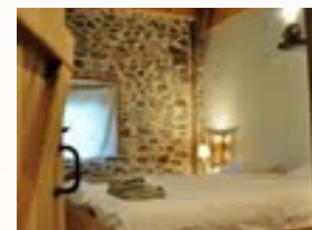
One of the bedrooms with 2 single beds.

*Student pricing and housing is available this week only, details are listed on the website www.atzbistro.com .