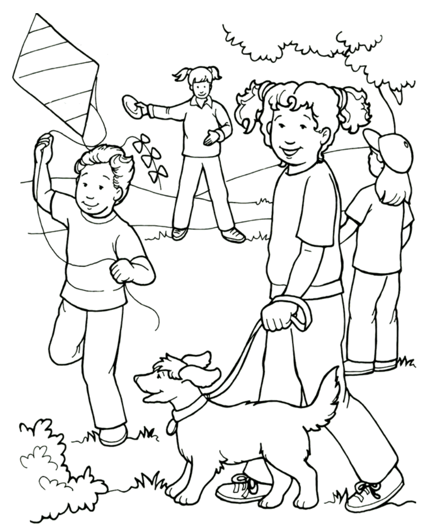
Love Your Neighbor as Yourself

From Thru-the-Bible Coloring Pages for Ages 4-8. © 1988 Standard Publishing. Used by permission. Reproducible Coloring Books may be purchased from Standard Publishing, www.standardpub.com, 1-800-543-1301.