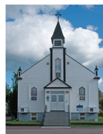
Our Lady of Mercy 11 St. Andrews Street Pointe-du-Chêne, NB