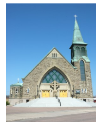
Saint Augustine's 340 Dominion Street Moncton, NB

December 30th, 2018 The Holy Family of Jesus, Mary and Joseph