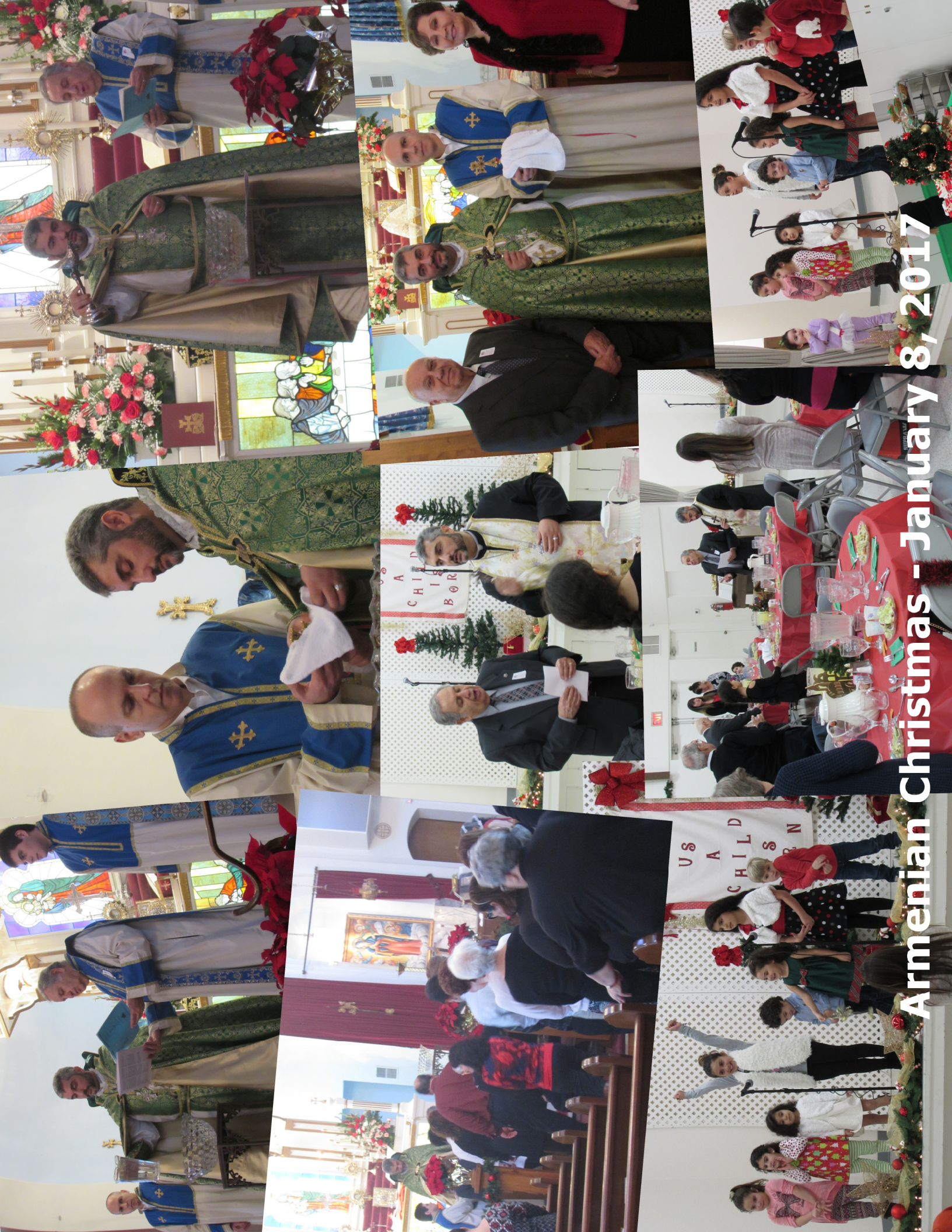
Armenian Christmas - January 8, 2017