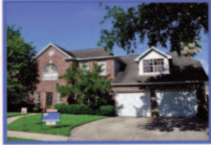
1107 Morning Mist

WOW!! Largest home (4,325) in Misty Lake!