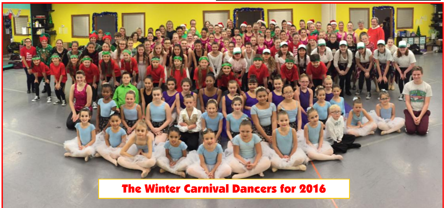
The Winter Carnival Dancers for 2016