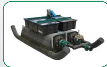
Duplex Low Profile BlackMax™ with optional installation floats

By confining the pumps and motors under water within the sled body there is minimal noise pollution.