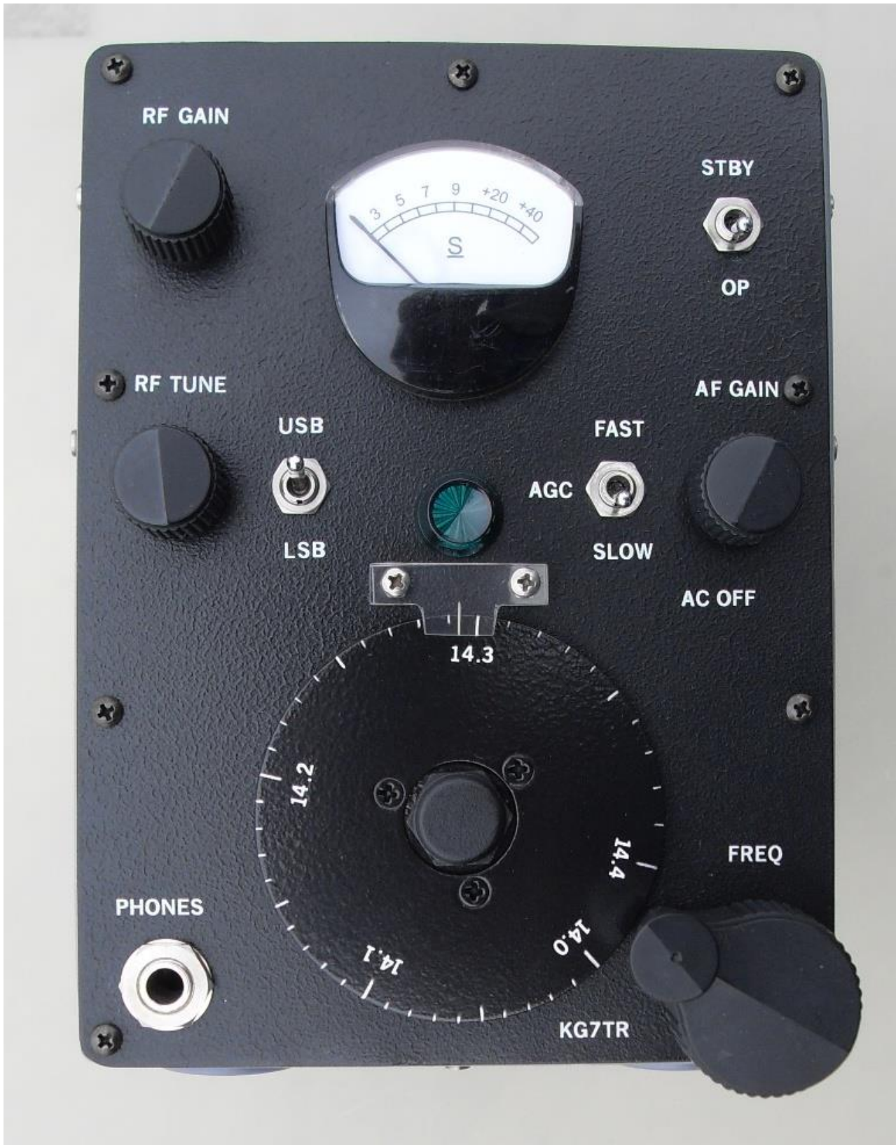
Figure 5: Front Panel. Meter scale is home made using computer drawing program.