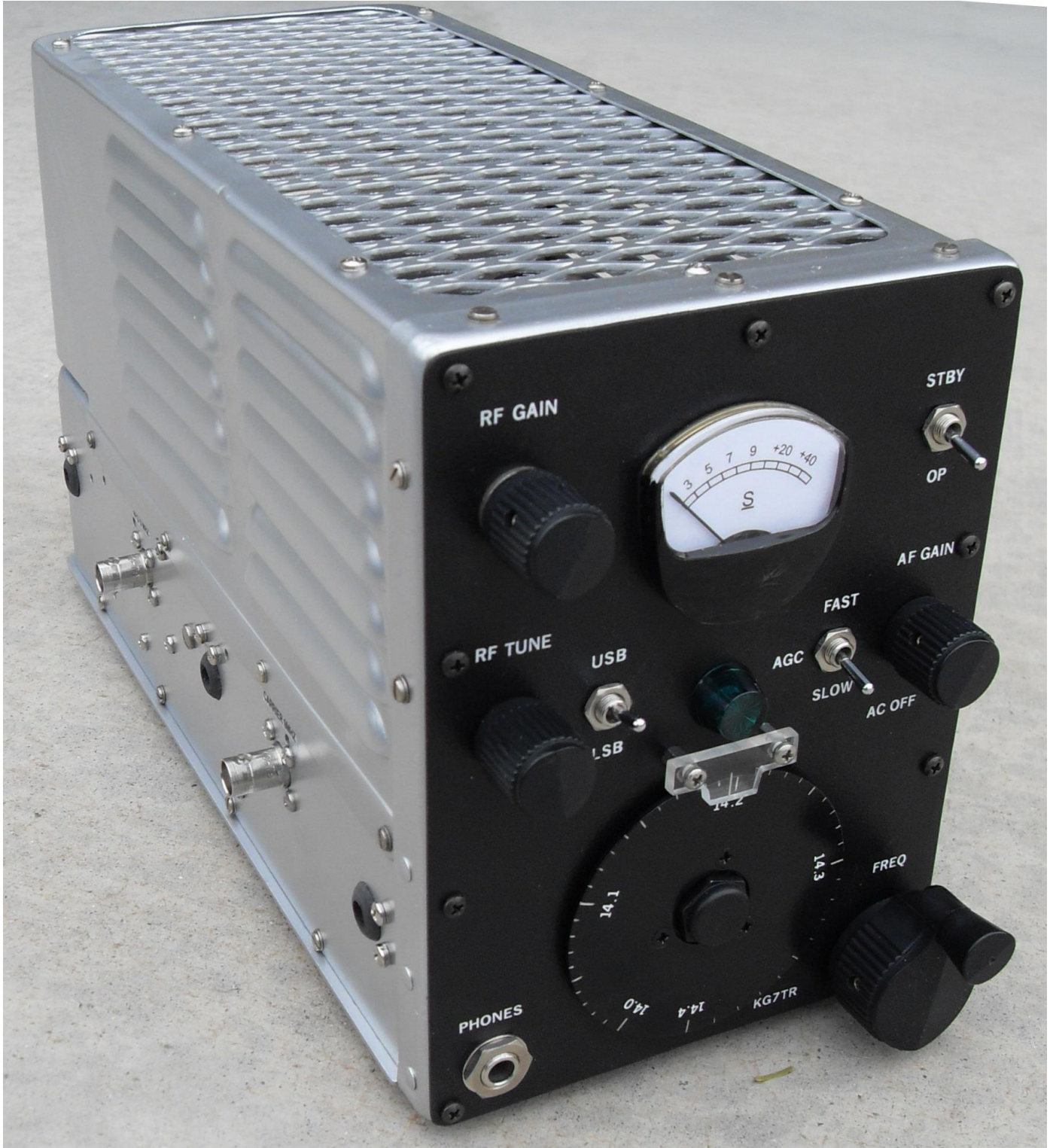
Figure 1: The Vintage SSB Special Receiver