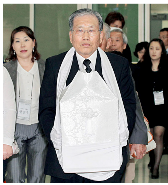
A somber Korean man returning to Seoul's Gimpo International Airport on May 19, bringing home the remains of his father who was killed during the war while conscripted by the Japanese

Last October Nishimatsu set up a 250 million yen fund (about $2.5 million) to compensate the 360 Chinese forced to build a hydroelectric plant at Yasuno in Hiroshima Prefecture, while a fund of 128 million yen (about $1.28 million) was set up last April to compensate the 183 Chinese who performed similarly backbreaking work at Shinanogawa in Niigata Prefecture. Both