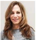
Snack Queen Jillicious

As always, we're looking forward to the 2024 Trail Dusters Graduation and snacking with y'all! And remember, no double dipping.