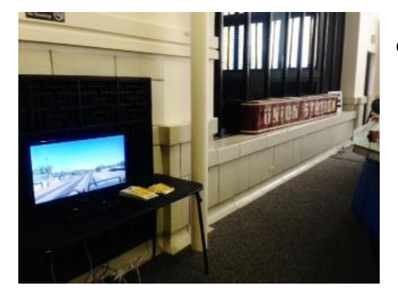
Conrad Youngblom brought his laptop for the public to view actual trains running.