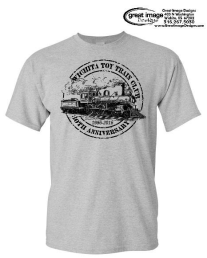
*All designs are custom made for each customer and are, therefore, considered property of GID and may not be copied or recreated for any reason without permission.*

This year the Wichita Toy Train Club is celebrating 30 years of existence. In this day and age this is truly a remarkable achievement in which all WTTC members can take pride. We would like to commemorate this achievement by having a special 30<sup>th</sup> anniversary celebration weekend which will include some games and prizes for kids, reduced admission, special anniversary t-shirts for club members and a dinner for club members and their invited guest(s).