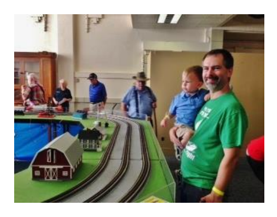
THANK YOU TO EVERYONE THAT PARTICIPATED!