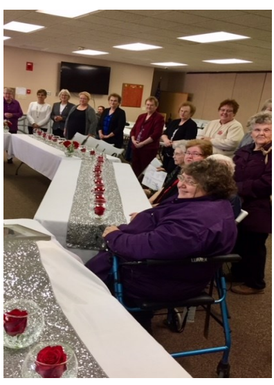
Living Rosary at Queen of Peace Church on CDA Sunday