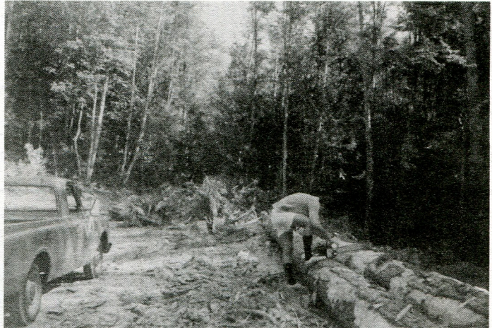
An early glimpse of Timbertop.

Another effort was made that year with a request is sued to the Lions Bay Village Office, that 'View Place' is to