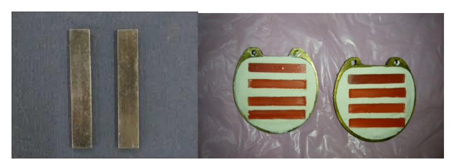
Fig 7: Rectangular wax patterns Fig 8: Wax patterns flasked

After the immersion procedure is completed, the surface roughness of each test specimen was measured again and the values were obtained (Fig 10). The roughness values before immersion were subtracted from the values after immersion to obtain the \Delta Ra (surface roughness differences).Each specimen was fixed on the table of the Instron testing machine and the fracture toughness was measured (Fig 11).