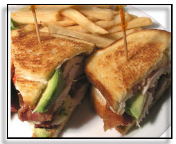
Avocado Bird Sandwich

Crisp greens topped with ham, turkey, cheddar cheese, tomatoes and a hard boiled egg..... ....9.99