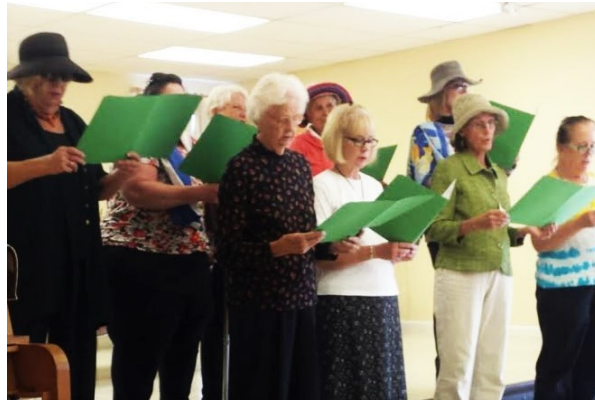
Sisters of the Sea

A good time was had by all at the Chili Dinner and Talent show on Sunday October 23. We, the people of God, gathered to share the good gifts of food, fellowship, talent and laughter. Shown here is just a sampling of the day's activities.