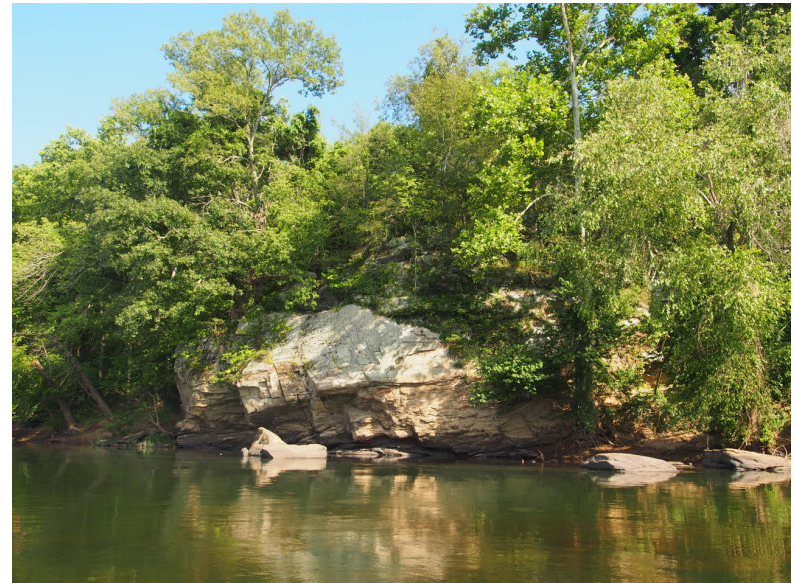
Cliffs Near Cartersville