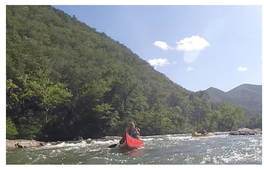
Upper James