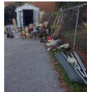
Cleaning out the shed after about 20 years..