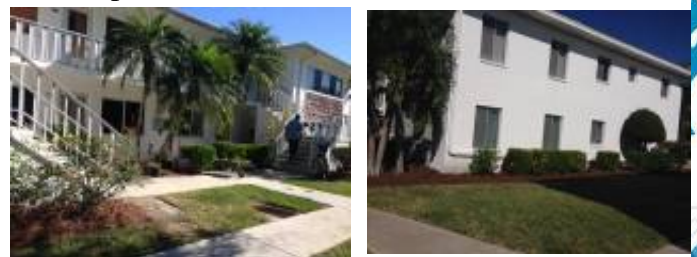
The first new bike rack!

A project to help beautify our common gardens was completed the week of March 21st.