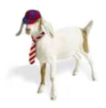
Figure A-3 Oxfam Goat