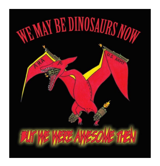
ARA shirt (front)