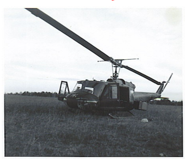
Early days of ARA –UH1B of 3/377/11 AAD Ft. Benning, GA 1963 Note Artillery insignia on nose.