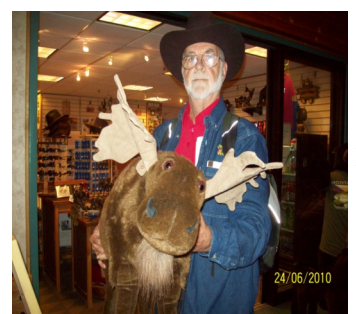
The good doctor experiencing a moose hunt at the Bozeman Reunion, 2010