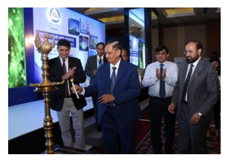
Eminent Dignitaries inaugurating the PPAM 2017 on April 21st and 22nd 2017