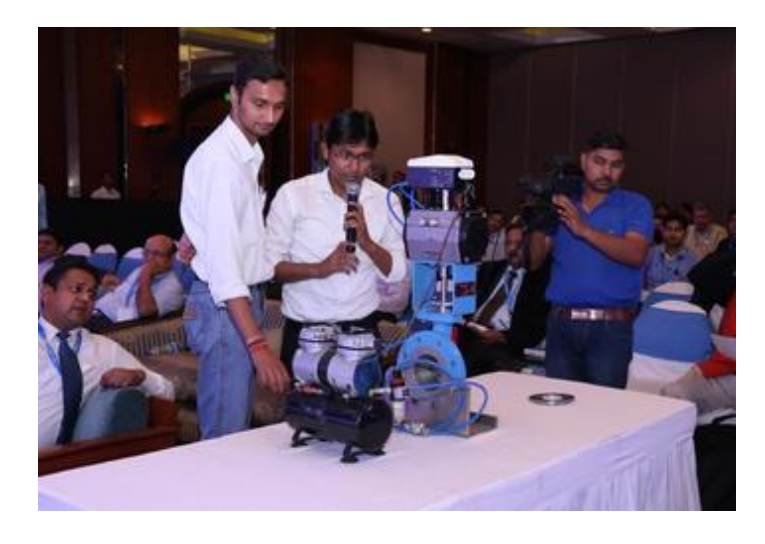
Special Workshops being conducted for young engineers during PPAM 2017